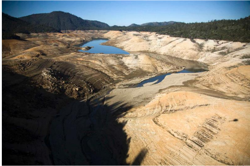
Oroville Reservoir, 2009.

scenarios in which these vital waters can be sustained into the future."