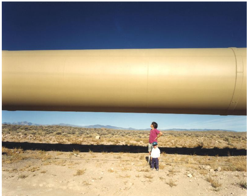
California Aqueduct, Owens Valley