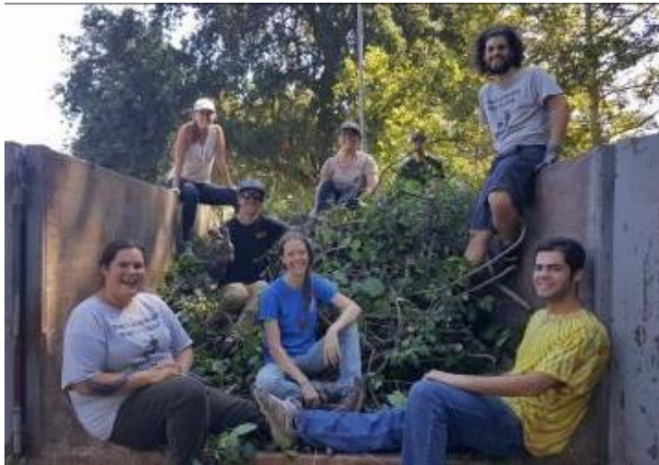
In August BEC staff, family and friends got started with the help of the Parks Department clearing vegetation along Big Chico Creek

In partnership with the City of Chico and their adopt-a-spot program, BEC has adopted two locations to restore. We will focus on removal of invasive species, replacing with natives, bank stabilization, and creating usable natural space for the public. We have adopted two spots, Teichert Ponds and the banks of Big Chico Creek from the CARD center to Mangrove.