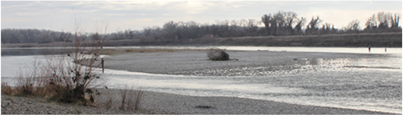
Sacramento River.