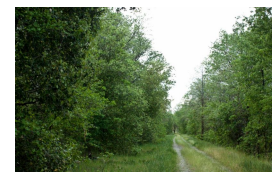
Comanche Creek area proposed tree removals.

At least two dozen concerned citizens spoke out at a public forum held on August 31 at the City of Chico Bidwell Park and Playground Commission (BPPC) meeting. The forum was to provide info about Pacific Gas & Electric (PG&E) plans to remove 86+ trees from above a gas pipeline in South Chico, near Comanche Creek from the Midway at Hegan Lane to approximately Estes Road.